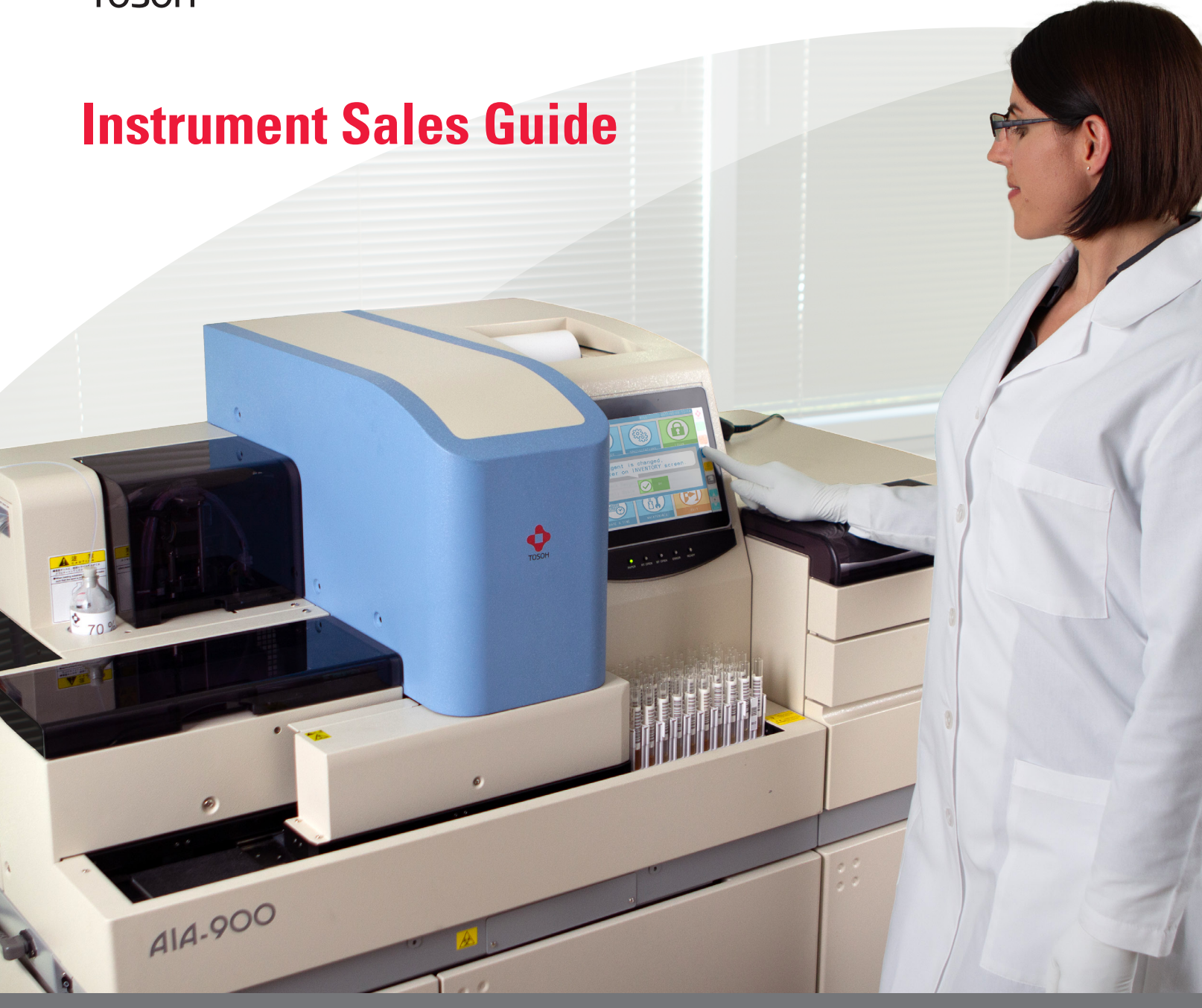
HPLC and Immunoassay Analyzers